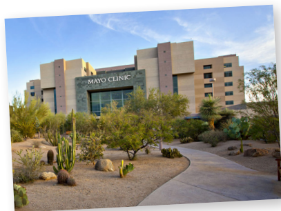
The Scottsdale, Arizona, campus opened in 1987. Mayo Clinic Hospital and the Phoenix campus (pictured) opened in 1998.

from their original mission. Culture clashes and economic dislocations often resulted. Mayo's leaders, by contrast, remembered Dr. Will's words: "We never have been allowed to lose sight that the main purpose to be served by the Clinic is the care of the sick."