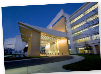
The Jacksonville, Florida, campus opened in 1986. The hospital (pictured) opened in 2008.