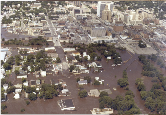
Flood! Rochester, Minnesota, July 5-6, 1978.