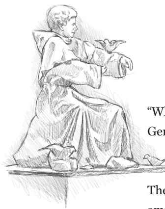
St. Francis of Assisi — statue at Saint Marys.