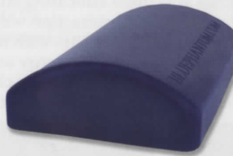
Regional Anesthesia Ultrasound Training Block Model

As graduates of Mayo Clinic's Nurse Anesthesia Program, we wanted to inform you of two educational products we hope to purchase that will further strengthen the training of current and future nurse anesthetists. With the addition of ultrasound to the practice of anesthesiology, the role of ultrasound-guided regional anesthesia has rapidly expanded. In an effort to keep our graduates competitive with other programs in ultrasound and regional anesthesia experience, we hope to add two simulation trainers for our students to utilize during their training: a Nerve Block Training System and a Blue Phantom Ultrasound Training Model.