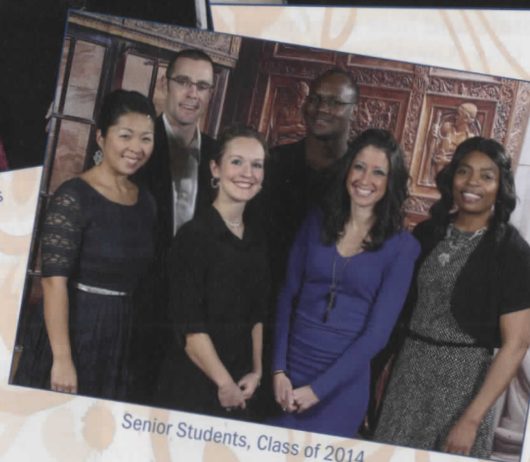
Senior Students, Class of 2014