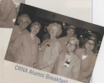
CRNA Alumni Breakfast