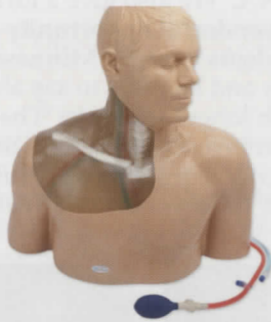
Gen II Ultrasound Central Line Model with Transparent Insert