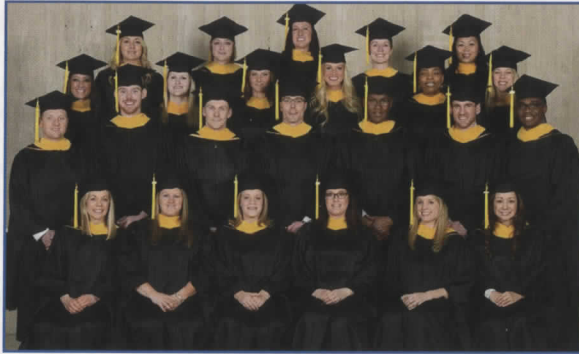
Mayo Clinic College of Medicine, School of Health Sciences, Master of Nurse Anesthesia Program 2014 Graduation Ceremony was held on March 15, 2014. 24 graduates