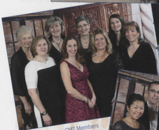
Alumni CMT Members