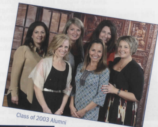
Class of 2003 Alumni