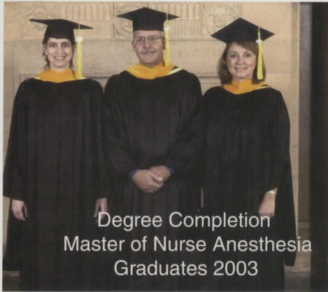
Degree Completion Master of Nurse Anesthesia Graduates 2003