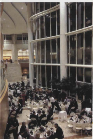
Alumni Dinner in Gonda Atrium