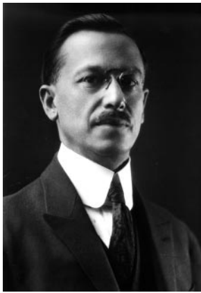
Figure 1. Louis Gaston Labat, MD.